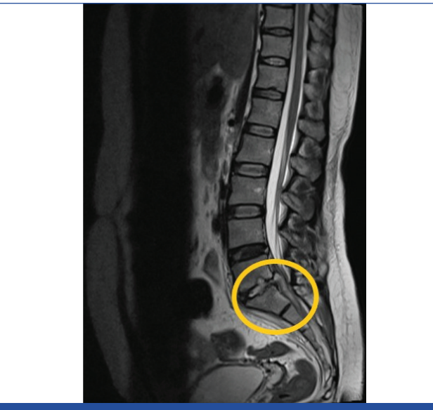
[Table/Fig-1]: Sagittal magnetic resonance image of the lumbar spine showing altered signal intensity of L5/S1 intervertebral disc level with end plate irregularities of inferior end plate of L5 and superior end plate of S1. There was associated soft tissue component/collection at this level extending inferiorly to S1/S2 level causing narrowing of neural foramen and compressing on the nerve roots at these levels. Displaying hypointense signal intensity on T2/STIR. Features consistent with infective aetiology-Spondylodiscitis

Keywords: Low back pain, Lumbosacral spine, Lumbar vertebrae