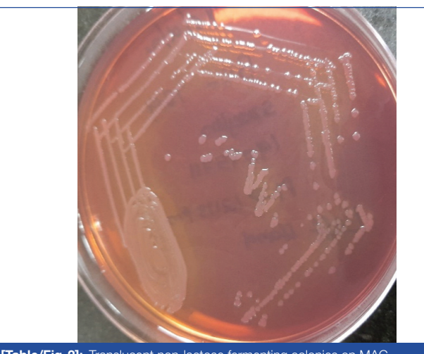
[Table/Fig-2]: Translucent non-lactose fermenting colonies on MAC.